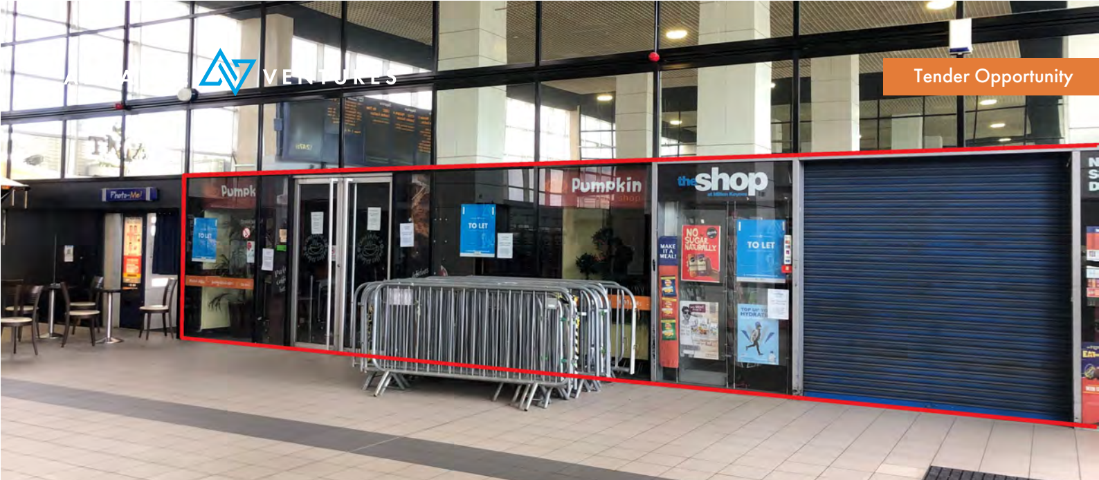
Milton Keynes Central Station