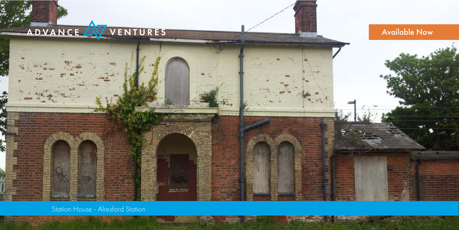
Station House - Alresford Station