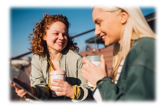
* Footfall figures from the Office of Rail & Road for 2022/23

For further detail about this opportunity please contact enquiries@advanceventures.co.uk